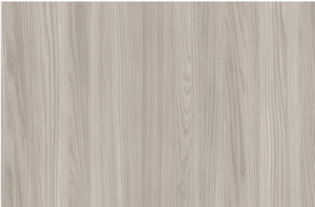
FINNISH ELM W7046