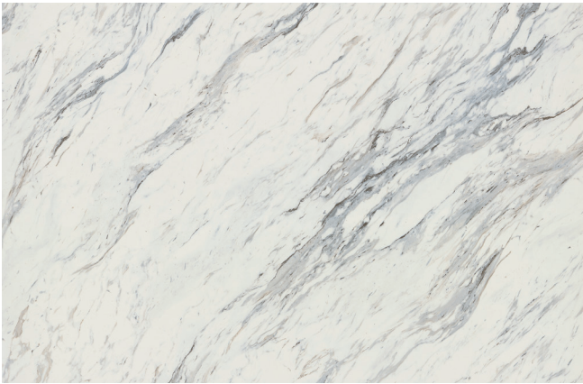
FORUM MARBLE W7048