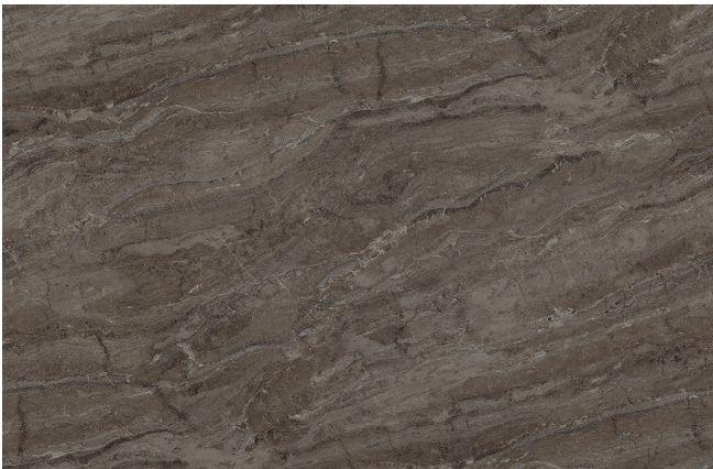
SABLE STONE W7047