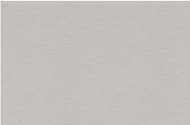
COASTAL REEDS W7045