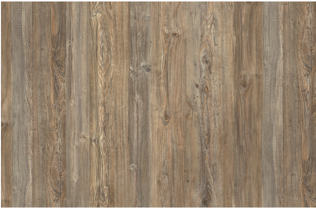
EMPORIUM WOOD W7025